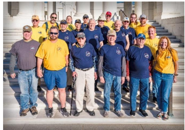
Veterans and their Guardians in Washington D.C.